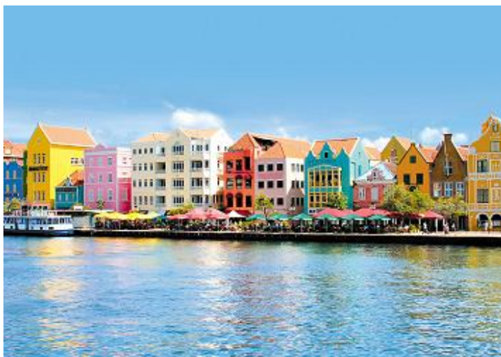
Downtown Willemstad on the Punda side, the capital of Curacao.

Opening hours' banks: from Monday through Friday 08:00 – 15:30 pm, some banks are open on Saturday morning as well (09:00 – 13:00 pm).